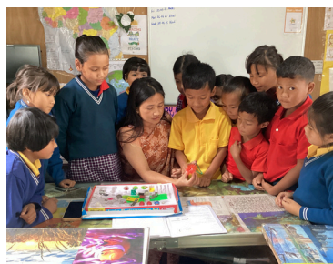
Science Experiment on electricity