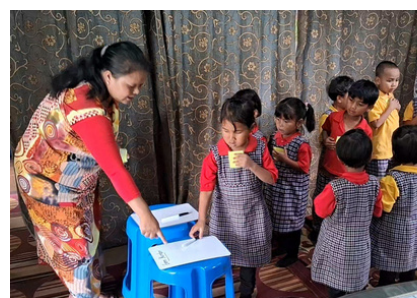
Odd and even numbers