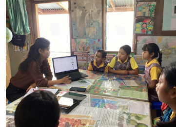
About compound nouns