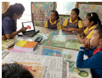
Learning about our brain