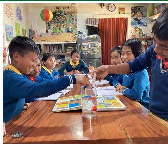
Experiment on molecules