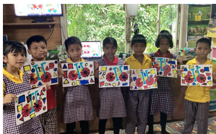
Mandrian Bicycle art