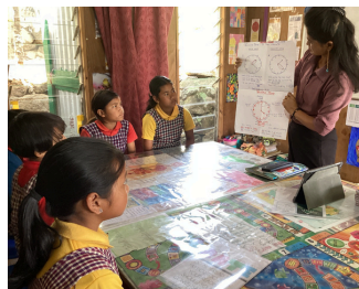
How to find durations