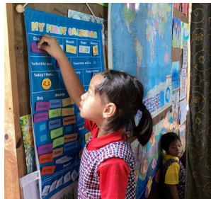
Identifying the weather