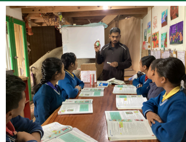
About various first aids